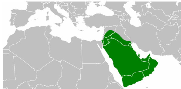
Figure 2 - A map showing the Rashidun Caliphate (highlighted in green) by the end of Abu Bakr's (r. 632 - 634 CE) life in 634 CE.

These conquests were initiated by Abu Bakr and successfully carried on by his successors Umar (r. 634-644 CE) and Uthman (r. 644-656 CE). Uthman , however, was not a strong ruler and was murdered in his own house by rebels in 656 CE. His death marked the breaking point in the history of the Islamic empire: his successor Ali (r. 656-661 CE) was pinned between handling a disintegrating realm and people insisting that justice be served to his dead predecessor.