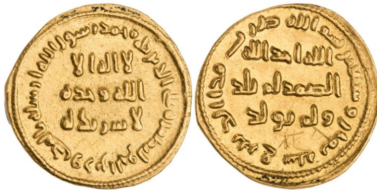
Figure 6 - A gold dinar of Abd al-Malik (r. 685-705 CE) minted in Damascus in 697/98 CE. Abd al-Malik introduced an independent Islamic currency in 693 CE, which initially bore depictions of the caliph before being abandoned for coins solely containing inscriptions.

In 685 CE, Al Mukhtar (l. c. 622-687 CE), started a revolt in Kufa and joined hands with Abdullah against the Umayyads . Al Mukhtar systematically hunted down all those who were involved in Husayn 's murder. An army sent by Abd al-Malik under Ubaidullah (the general from Karbala) was crushed by the combined forces of the Kufans and Zubayrids; the defeated general was put to the sword.