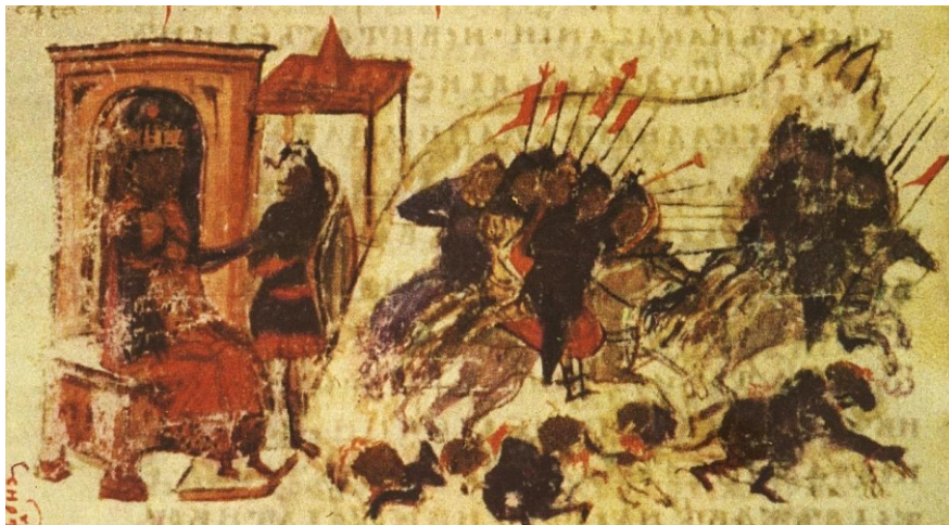
Figure 9 - The Siege of Constantinople by the Umayyad Caliphate in 717 – 718 CE, as depicted in the 14th-century Bulgarian translation of the Constantine Manasses Chronicle. The image has been digitally retouched.

Umar II (r. 717-720 CE) managed to rule for only three years as he was poisoned by his own family because of his unwavering stance on justice and on Islamic principles. This quality of his, supplemented by many of his admirable actions such as stopping public cursing of Ali , facilitating conversion and halting attacks on peaceful neighboring empires, has earned him much posthumous fame as he has often been dubbed as the fifth Rashidun Caliph .