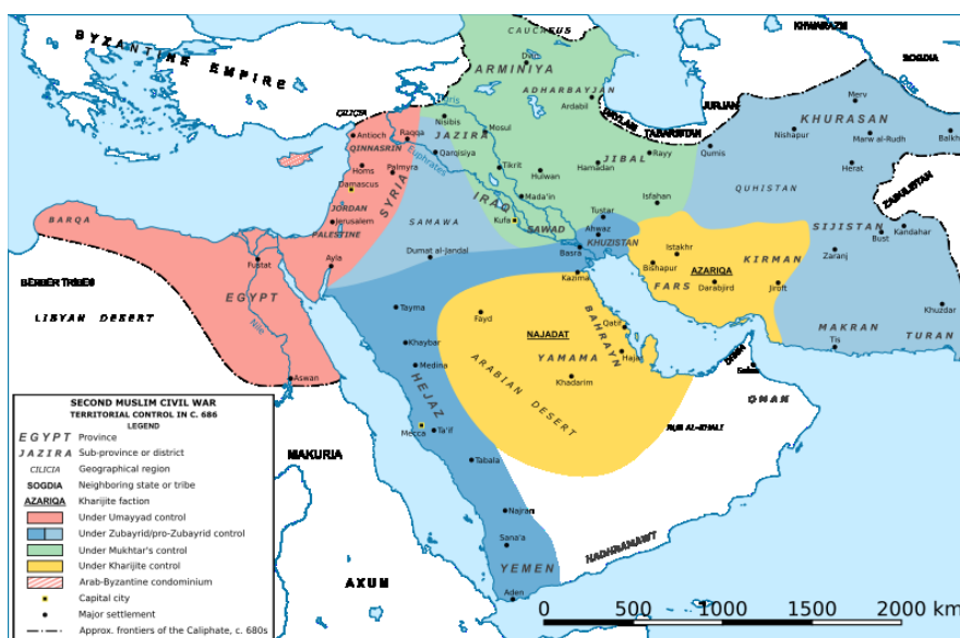
Figure 5 - A map depicting the divisions of the Islamic Empire during the second Islamic civil war - the Second Fitna. The dominions of the Umayyads, Zubayrids, Kharjites, Al Mukhtar and those regained by the Byzantines are shaded in colors as indicated by the key.

Abdullah continued his revolt for another decade, claiming the title of Caliph (r. 683-692 CE) for himself; he earned the fealty of Hejaz, Egypt, and Iraq – while his opponents were barely in control of Damascus after their sovereign's death.