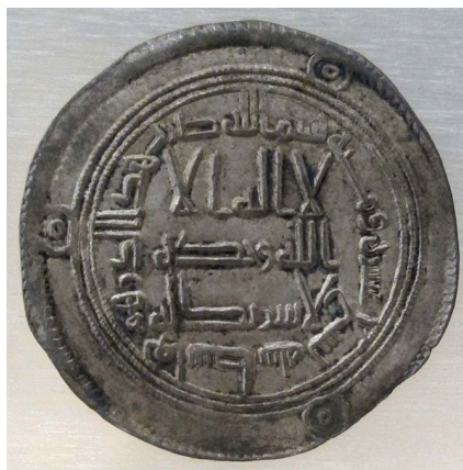
Figure 10 - An Umayyad silver coin (dirham) issued by Hisham ibn Abd al-Malik (r. 724-743 CE). Made in Damascus, c. 724-743 CE.

Some of his military expeditions were successful, others not so much: a Hindu revolt in Sindh (a province in modern-day Pakistan) was crushed, but a Berber revolt broke out in the western parts of North Africa (modern-day Morocco) in 739 CE. The Berbers had been stirred up by the fanatical teachings of Kharijite zealots (a radical and rebellious sect of Islam) and caused a great deal of damage, most notably, the deaths of most of the Arab elites of Ifriqiya at the Battle of Nobles (c. 740 CE) near Tangier. Attempts to crush the rebellion did not even come close to complete the objective, but the disunited Berbers soon disintegrated (743 CE) after they failed to take the core of Ifriqiya , the capital city of Qairouwan, but Morocco was lost for the Umayyads .