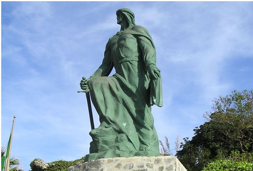
Figure 11 - A modern statue of Abd al-Rahman I, founder of the Emirate of Cordoba, r. 756-788 CE. Almuñécar, Spain.

The Abbasids showed no mercy to the Umayyads ; all male members were slain, a surviving few retreated to their hideouts. Umayyad graves in Damascus were dug out and their remains torn apart and burnt – except for Umar II , whose grave was spared because of his reputation. Then the Abbasids invited all of the surviving members to dinner on the pretext of reconciliation but, when they were seated at the table, at the signal of the new Caliph, assassins entered the room and clubbed them to death. Abd al-Rahman I , a grandson of the able Hisham , survived the horrible fate of his kinsmen, he managed to escape the Abbasids and made a perilous journey across the empire and landed in Al Andalus, where he formed the Emirate of Cordoba in 756 CE, which rivaled the Abbasid realm in elegance and grandeur.