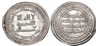
Figure 1- Silver dirham from the reign of Umar II (r. 717 - 720 CE). Minted c. 718/719 CE. Basra, Iraq.

The Umayyads ruled effectively and firmly established the political authority of the Caliphate, rebellions were crushed with brute force, and no quarter was given to those who stirred uprisings.