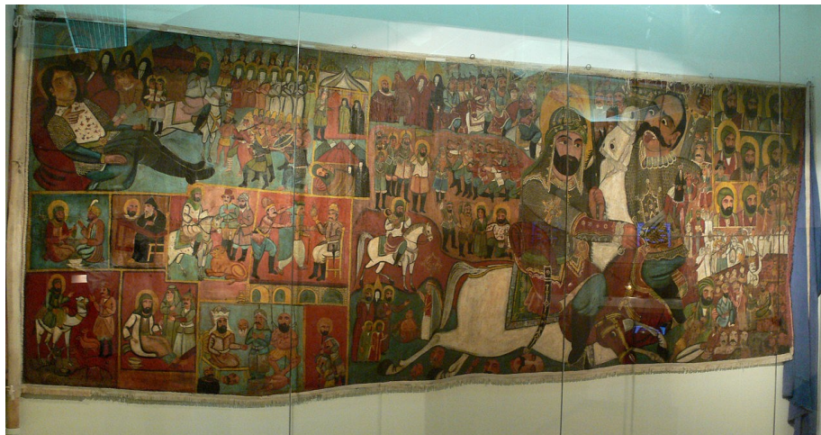
Figure 4 - A painting of the Battle of Karbala in 680 CE Iran. Iranian painting, oil on canvas, 19th century.

In 680 CE, Husayn , convinced by the people of Kufa, marched to Iraq, intending to gather his forces and then attack Damascus. Yazid , however, put a lockdown on Kufa and sent his army, under the command of his cousin: Ubaidullah ibn Ziyad (d. 686 CE) to intercept Husayn's force. The two parties met in Karbala, near the Euphrates, where Husayn's army – some 70 combatants (mostly family members and close associates) made a heroic stand and were all brutally massacred and Husayn beheaded. This sparked the second civil war of Islamic history – the Second Fitna (680-692 CE).