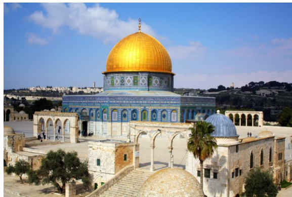
Figure 7 - Dome of the Rock in Jerusalem, originally constructed in 691-692 CE in the reign of Caliph Abd al-Malik.

Although he has not escaped the criticism for Hajjaj 's cruel deeds, Abd al-Malik is credited for bringing stability and centralization to the empire, Most notably he Arabized the whole of his dominion, which in time helped the propagation of Islam; he also established official coins for his empire.